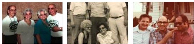
Tootsoe - April 21, 2022 at 05:05 PM

“ 3 files added to the album Memories Album